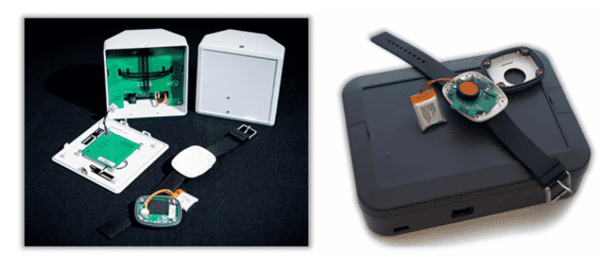
Figure 2. Standard Anchors & Tags

SALUS is built on LoRaWAN emulation and radio ranging at 2.4GHz, using SX1280 chipset. The SALUS system is a 'one stop shop' solution, with all hardware and software elements provided, including a dedicated Android app. All the devices are robust and use low power, replaceable or rechargeable batteries (lasting up to 3yrs), requiring very little maintenance and installation overheads.